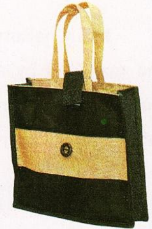
Jute Big Shopper Bag