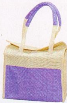
Jute Lunch Bag