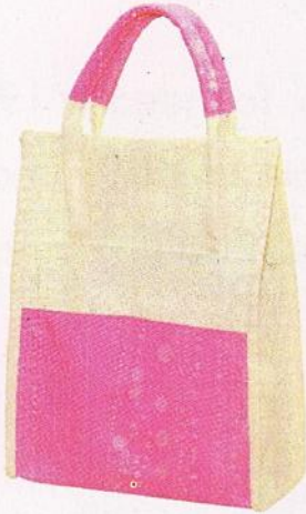
Jute Lunch Bag

A Creation of persons with Mental Disabilities