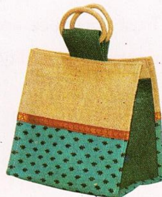
Jute Thambulam Bag

The products are available for sale at our