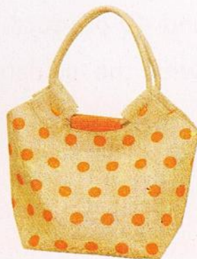
Jute Lunch Bag